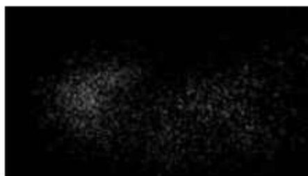
Frame 1 Snow enters the frame from the edges