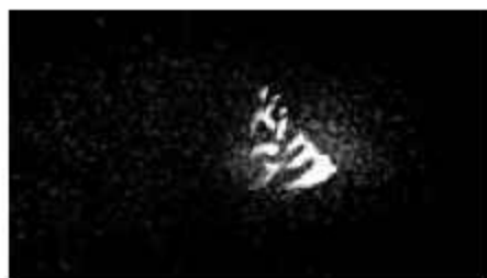
Frame 2 Snow twirls and begins to create the SkiBig3 logo