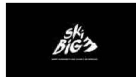
Frame 4 ...to reveal the SkiBig3 logo.