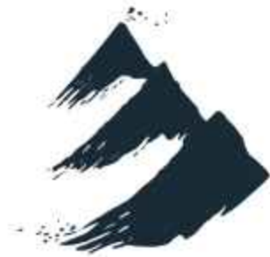
SkiBig3 Icon - Blue

Once equity has been built behind the SkiBig3 brand and the primary logo is a recognized entity then the Icon can be used by itself.