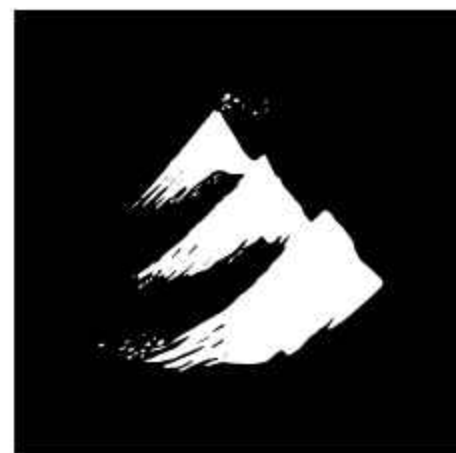
SkiBig3 Icon - White