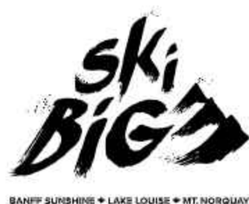
SkiBig3 Logo with Resort Lockup - Black

It may become necessary, due to printing limitations, to print the logo in black only. When this situation arises, the reverse logo will become white out of a black background and the positive logo version becomes black on a white background.