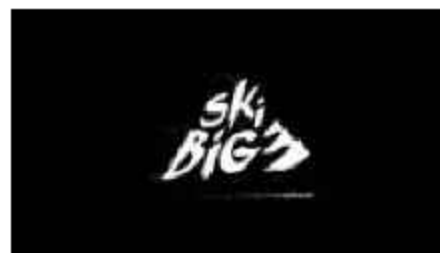
Frame 3 As the SkiBig3 logo appears, the remaining twirling snow blows out of frame...