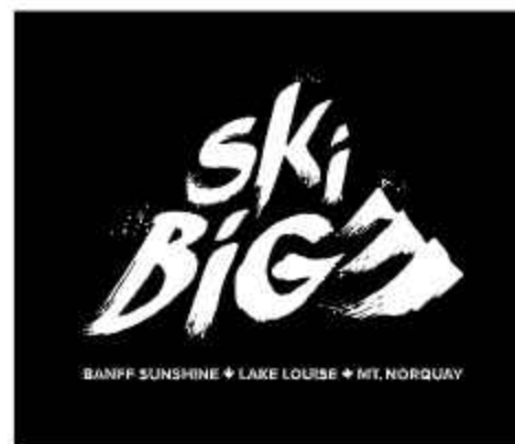
SkiBig3 Logo with Resort Lockup - White