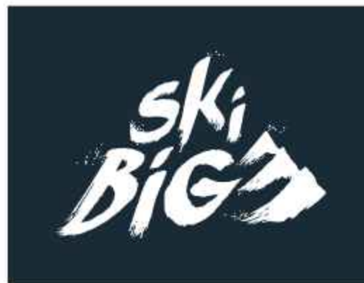
SkiBig3 Logo - White