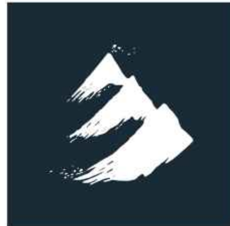
SkiBig3 Icon - White