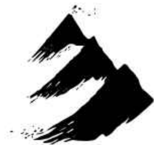
SkiBig3 Icon - Black