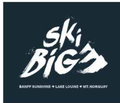
SkiBig3 Logo with Resort Lockup - White